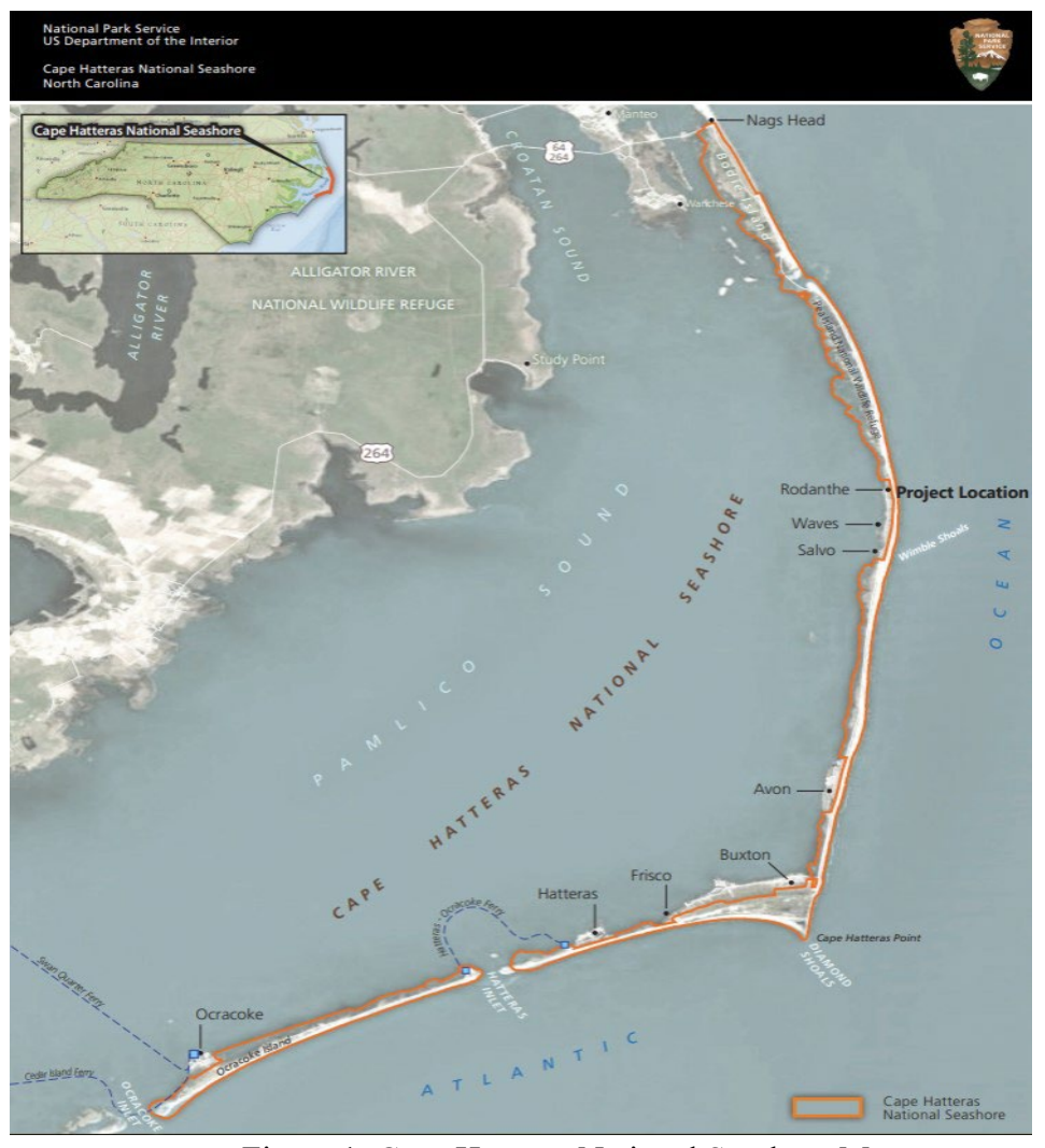
Figure 1: Cape Hatteras National Seashore Map